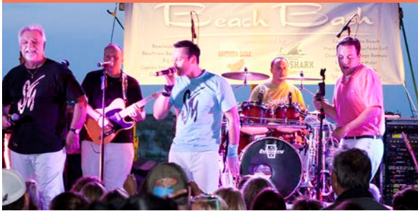
• Labor Day Beach Bash