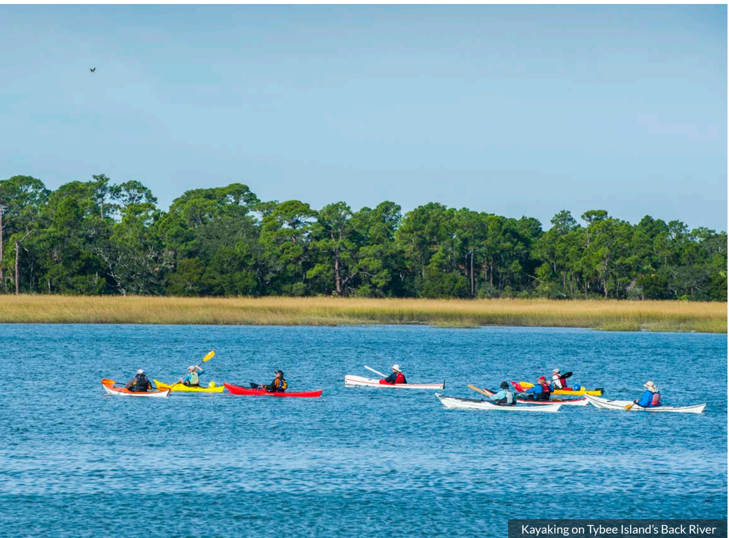
Kayaking on Tybee Island's Back River

Savannah Parks and Gardens: Explore Savannah's beautiful parks and botanical gardens to get a glimpse of the colorful and hearty plants that grow in the coastal zone. From the Savannah Area Council of Garden Clubs' Botanical Garden, the Coastal Georgia Botanical Gardens or Forsyth Park, there are several varieties of flora to be seen.