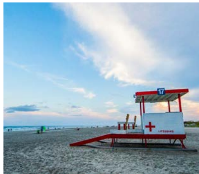
SERVICES (page 14)