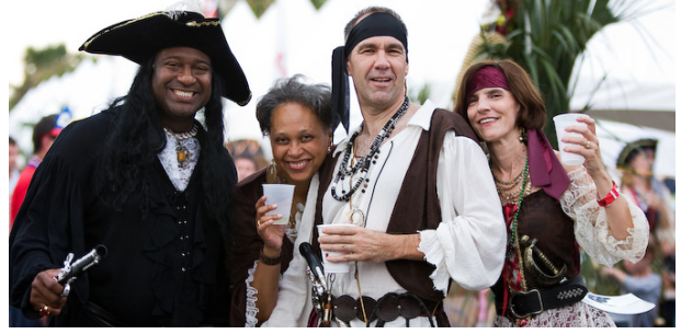
• Tybee Island Pirate Fest