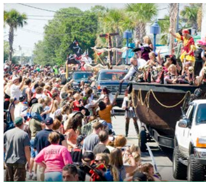
EVENTS (page 6)