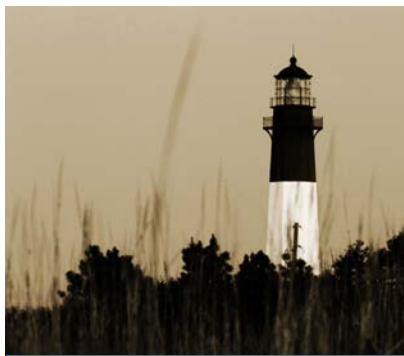
ATTRACTIONS (page 4)