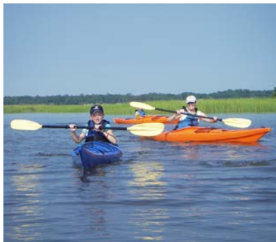
ITINERARIES (page 8)