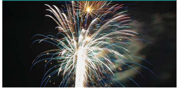
• New Year's Eve Fireworks